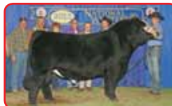
Mr. HOC Broker, Sire

She is one of my favorite Broker daughters out of our great Cassie cow. She has potential written all of her as she is deep flanked, square hipped made and she pulls it all together into such an eye appealing package. Make sure to look this one up on sale day.