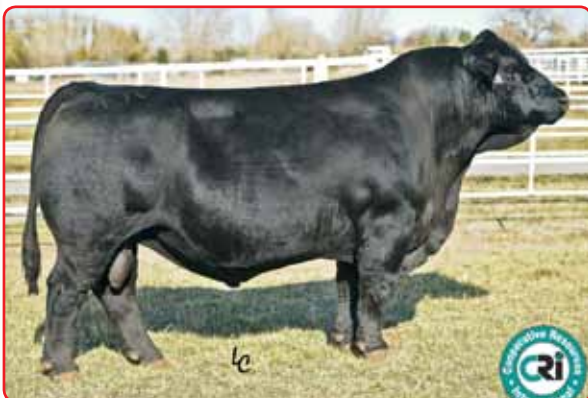
TNT Tanker U263

Black Dbl Polled Purebred ~ ASA#2510801 Ellingson Legacy M229 x Ellingson Hummer T713