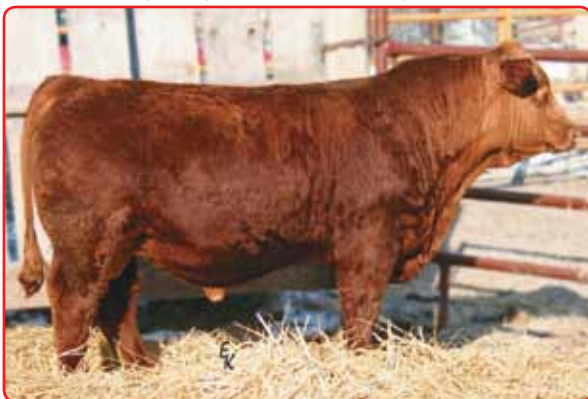
WS Beef King W107

Homo Black Homo Polled 1/2 SM 1/2 AN ~ ASA#2470582 S A V Final Answer 0035 x TNT Miss S68