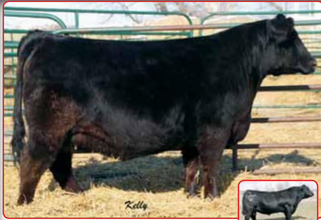
Kelly Connealy Thunder, A.I. Sire