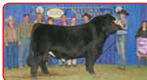
Mr. HOC Broker, Sire

These three amigos all come from the same blue print. Brant Cassie on dam side going to the many time champ HOC Broker. Loaded up with a ton of volume, base width, depth and eye appeal, these guys are sure to produce some front pasture females. Make sure to check these three out sale day.