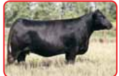
SVF NJC Jewel, Dam

This bull is a full brother to the high selling bull on Gonsior's production sale last year, went for $27,000. He is out of one of the best cows in the breed, SVF NJC Jewel, with the well known Upgrade on the sire side. Don't miss out on this opportunity to own some of the best genetics in the breed. Retaining 1/2 semen interest.