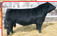
Wheatland High Octane, Sire