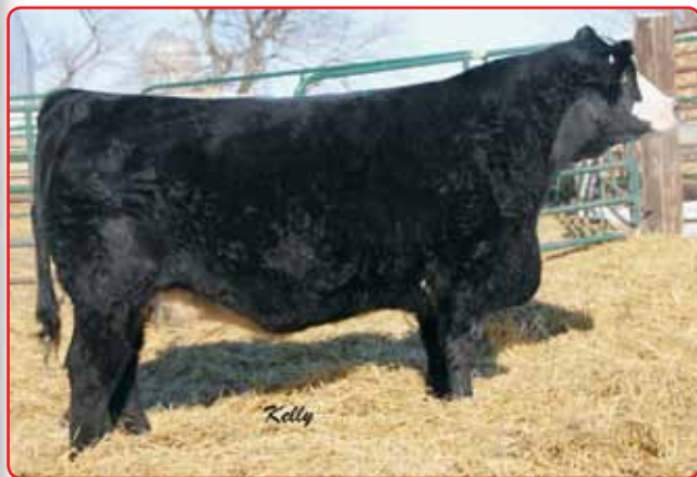
S A V Bismarck 5682, A.I. Sire