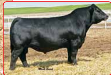
Mr NLC Upgrade, Sire to Lots 38-39A