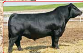
Mr. NLC Upgrade U8676, Sire