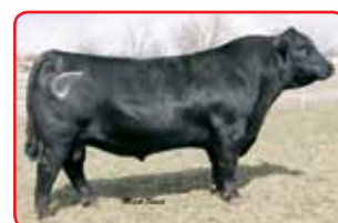
Connealy Thunder, Sire

Here's a moderate framed, easy fleshing heifer and as deep sided as they come. She's out of popular female sire Connealy Thunder known for producing great females with perfect udders. She's bred to our go to bed, no worries calving ease bull that doesn't give up performance or eye appeal.