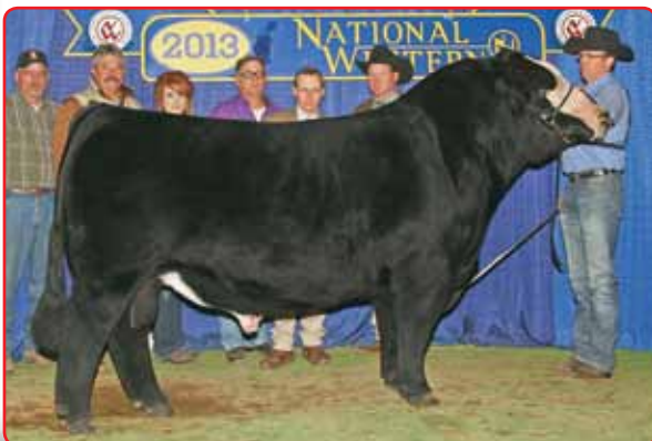
Mr. HOC Broker

Black Dbl Polled Purebred ~ ASA#2494461 Wheatland Bull 680S x Keystone Radiance 13R