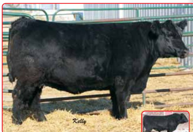
CFSR Rocket 1145, Pasture Sire