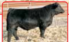
Elm-Mound/GS Upgrade A2, Full Brother

Ellingson Legacy M229 Mr. NLC Upgrade U8676 Ms. NLC Mojo S6119 B CNS Dream On L186 SVF NJC Jewel S306 NJC Black Jewell