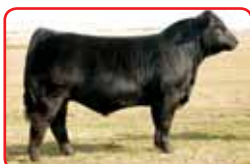
New Trend Way Cool 6W, Sire

Ms. Becca, out of our lead donor cow Cassie. She is really attractive made clean fronted big topped, square hipped, super disposition. She will make a great junior prospect and in the end, even better cow. She is one that should stay on the ranch but we are bringing the best to town!