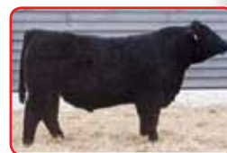
TNT Tuition, Sire of Lots 15 & 16