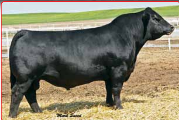
Mr. NLC Upgrade U8676

Homo Black Homo Polled Purebred ~ ASA#2474338 Ellingson Legacy M229 x Ms. NLC Mojo S6119 B