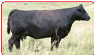
KSR 25M, Dam

These bulls are full sibs to our high selling bull at Watertown Farm show in 2013 going to Friske Farms. Both bulls are impressive individuals being big topped, heavy muscled, sure footed and free moving. True performance bulls, don't miss out on these two Upgrade sons.