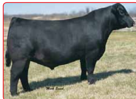
S A V Brilliance 8077, Sire

This Brilliance son brings a very impressive set of EPDs to the table. With a very impressive pedigree as well Bismarck and Shear Force (use this bull with confidence on heifers) has been a standout since day 1, make sure to look this guy up sale day, you will not be disappointed.