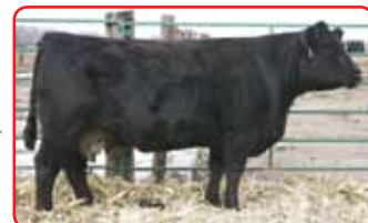
Brant Cassie U9323, Dam of Lots 75 & 76