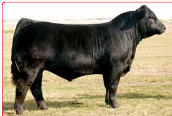
New Trend Way Cool 6W

Homo Black Homo Polled Purebred ~ ASA#2470581 Mr. NLC Superior S6018 x TNT Miss S17