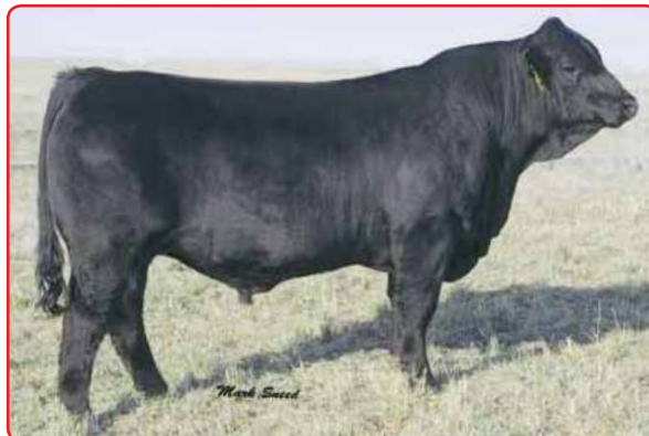
Ellingson Dominator W905

Red Dbl Polled Purebred ~ ASA#2499589 WS Beef Maker R13 x WS Miss Dreamboat T17