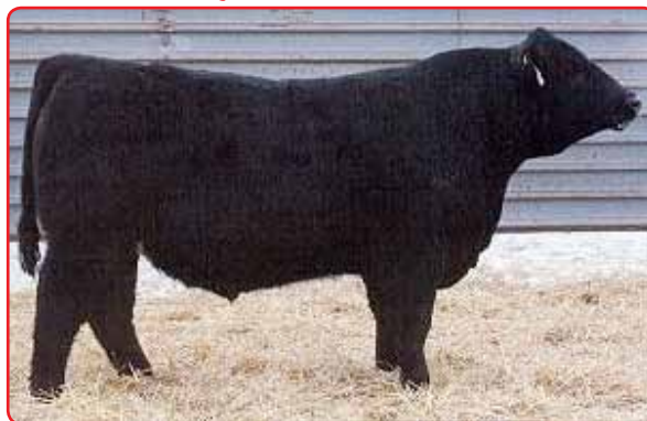
TNT Tuition U238

Homo Black Homo Polled Purebred ~ ASA#2474338 Ellingson Legacy M229 x Ms. NLC Mojo S6119 B